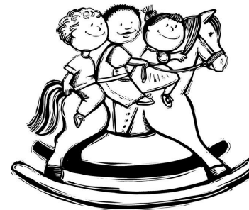
Robeson Township Play Group